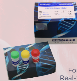
Universal Ref. DONO-UX

The reagent is ready to use in 0.2 mL PCR tubes.