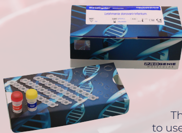
Monotest Ref. DONO-ABI32

The reagent is ready to use in 0.2 mL PCR tubes.